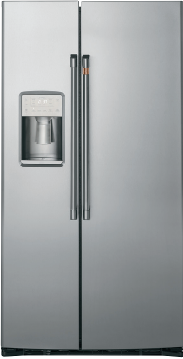
CZS22MP2NS1 Stainless Steel with Brushed Stainless handles