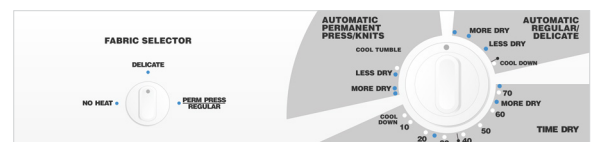
DV2 Control Panel