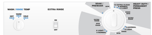
TV2 Control Panel

Speed Queen® two-speed top load washers and matching dryers are durably constructed using premium materials for long-lasting, reliable performance and superior results. If you want your laundry done right, you want a Speed Queen. Our machines are manufactured using metal instead of plastic. They're built with rugged, commercial-grade construction. Our world-class test lab rigorously pushes our products far beyond the conditions they're likely to ever face. We work hard at every point of our manufacturing process to ensure that our machines reflect that belief.