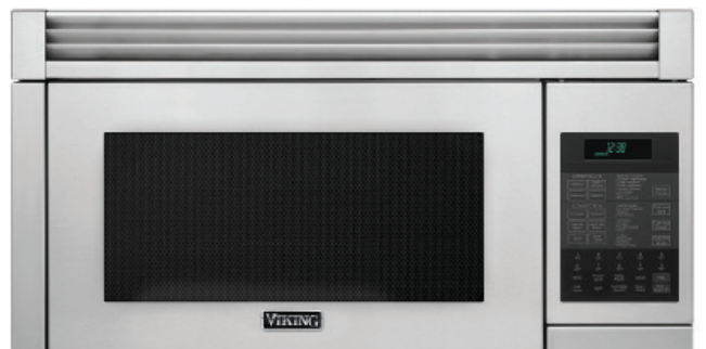
30" Wide Convection Microwave Hood