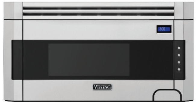
30" Wide Conventional Microwave Hood