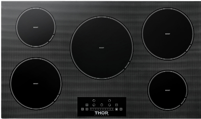
Product: 36 Inch Induction Cooktop Model Number: TIH36